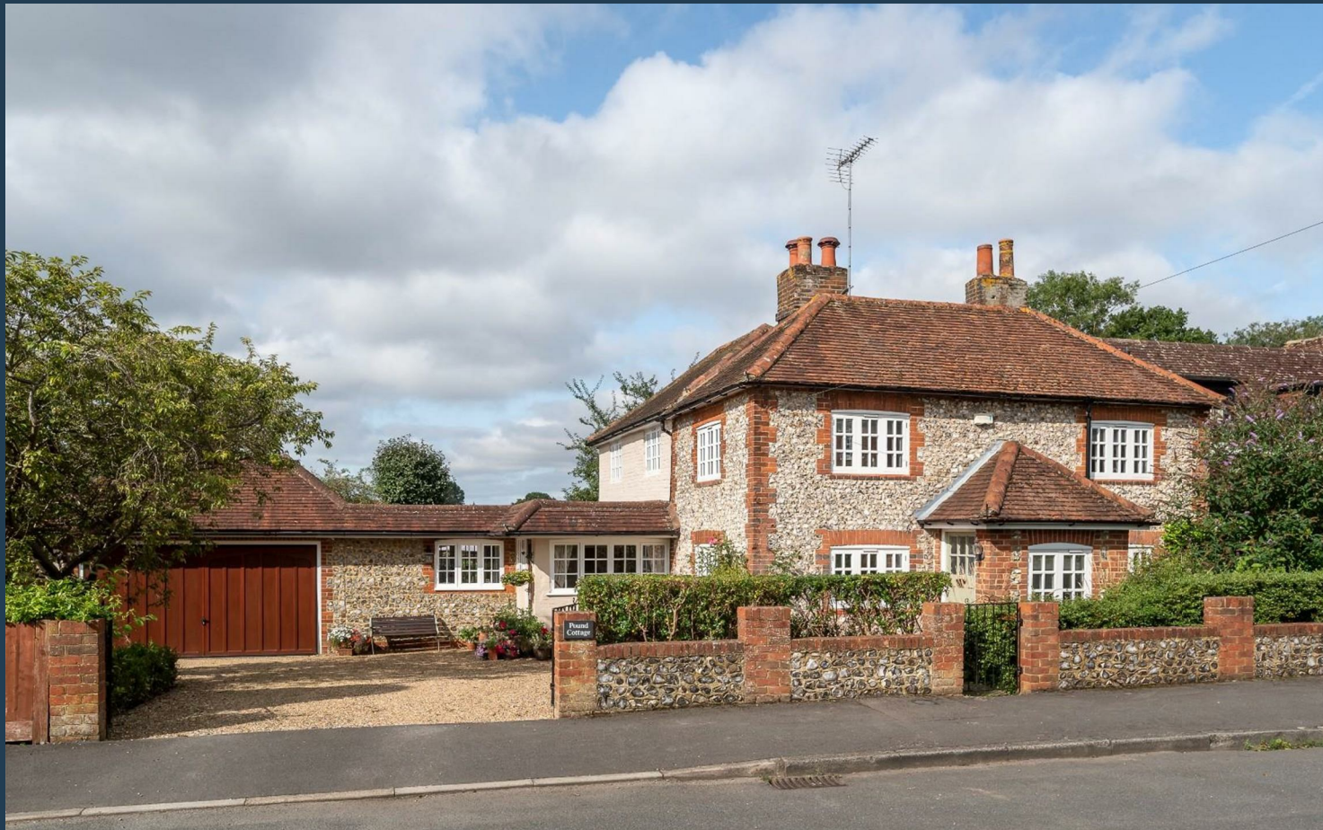
Pound Cottage Old Merrow Street, Guildford GU4 7AY